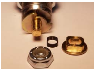
90° Governor Applied