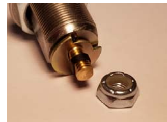
Black Adaptor Applied